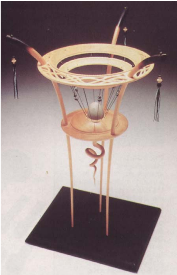
Clockwise from right: The Sorcerer's Potion Pot Bug Bowl Wave Edged Bowl Ceremonial Bowl Enchanted Wood In Memory of an Alluvian Discovery